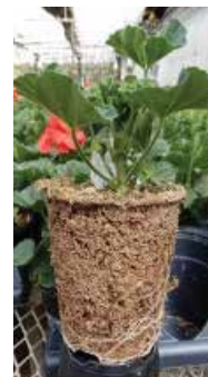
LEVEL 1 NO MOISTURE, DULL GREEN LEAVES, COULD START TO WILT.