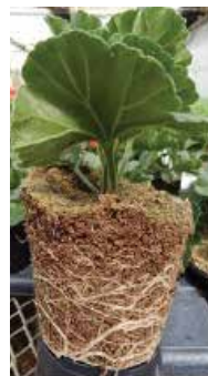
LEVEL 2 LIGHTER COLORING VS LEVEL 3. PLANT NOT WILTING, FEELS DRY/LITTLE MOISTURE.