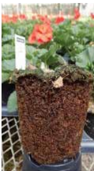
LEVEL 5 AT CONTAINER CAPACITY, WATER DRIPPING OUT OF THE POT.

WE ENCOURAGE EVERY GROWER TO WORK WITH THEIR TEAM TO DEVELOP THEIR OWN MOISTURE LEVEL / SCALE.