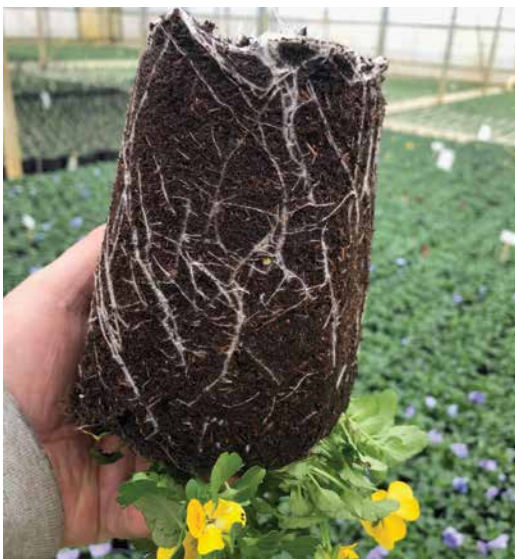
QUART PANSIES - ABOUT 4 WEEKS AT BELL NURSERY

Before we left the call, we asked Ashley to share some thoughts with growers who have not looked into HydraFiber yet. To growers either considering blending with HydraFiber onsite or buying a premix soil with HydraFiber in it, he says, "We trialed HydraFiber extensively over 18 months to get our growers knowledgeable about watering practices and other differences over a peat or perlite-based media, then made the switch to HydraFiber Ultra 160WB in December 2019. We started at 30% HydraFiber, are now at 40% and we're doing some tests at 50%. Increasing the rate, we see better water-holding capacity, better plants and cost savings."