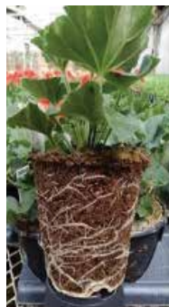
LEVEL 3 LIGHTER COLORING VS LEVEL 4. FEELS MOIST, BUT CAN'T SQUEEZE WATER OUT.