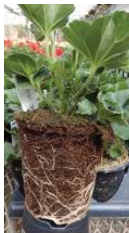
LEVEL 4 NO DRIPPING WATER, CAN SQUEEZE SOME WATER EASILY FROM MIX/POT.